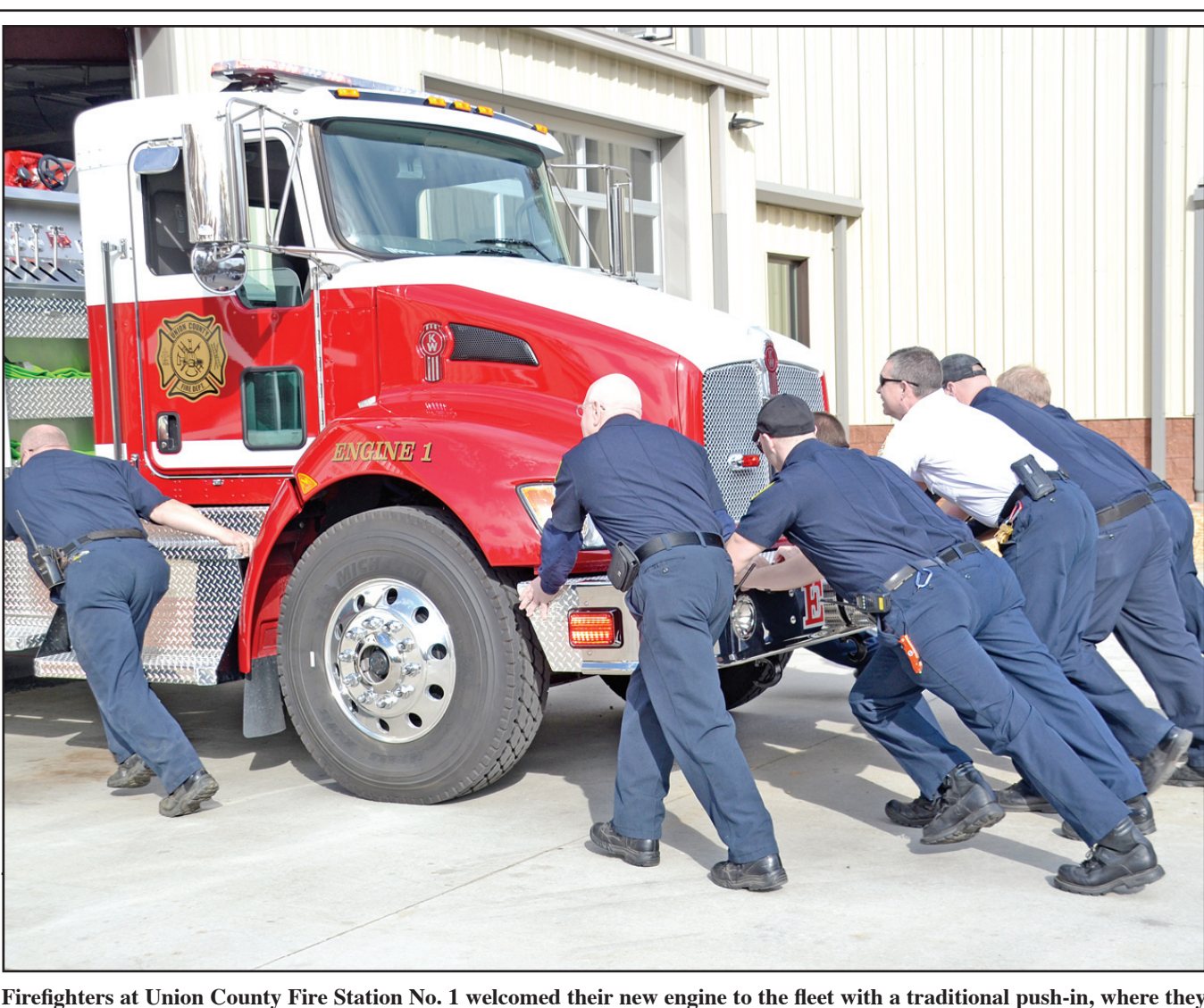
Firefighters at Union County Fire Station No. 1 welcomed their new engine to the fleet with a traditional push-in, where they pushed it into the station.

"We just feel blessed that people have supported SPLOST and that we're able to use the funds for a lot of different reasons, not only for paving roads. This is one of the key areas where it's needed because public safety is really a No. 1 for everybody in the county. "Without public safety, you don't have much, so we have to take care of that. We really do have great equipment and some of the best trained firemen around."